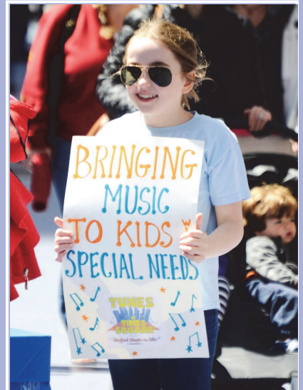
MMFL Singer volunteering