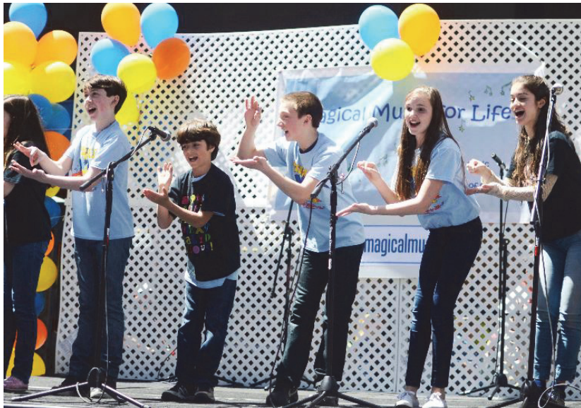
"Jane"s and "Michael"s from various casts of Mary Poppins teach the audience the choreography for "Supercalifragilisticexpialidocious"

A big "THANK YOU" to all the singers, dancers, Broadway performers, volunteers, and donors who helped to make Magical Music for Life Foundation's second annual TUNES IN TIMES SQUARE such a terrific event. Your talent, enthusiasm, and assistance before and on May 5 th were appreciated by the audiences and all of us involved with TUNES.