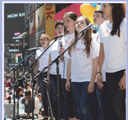
Lighthouse Youth Theatre