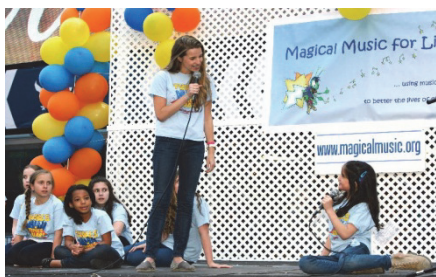
The debut concert of songs from A Day in the Life of a Child

A big "THANK YOU" to all the singers, dancers, Broadway performers, volunteers, and donors who helped to make Magical Music for Life Foundation's second annual TUNES IN TIMES SQUARE such a terrific event. Your talent, enthusiasm, and assistance before and on May 5 th were appreciated by the audiences and all of us involved with TUNES.